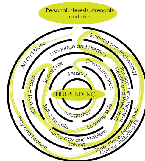
Key Stage 3 Curriculum Wheel